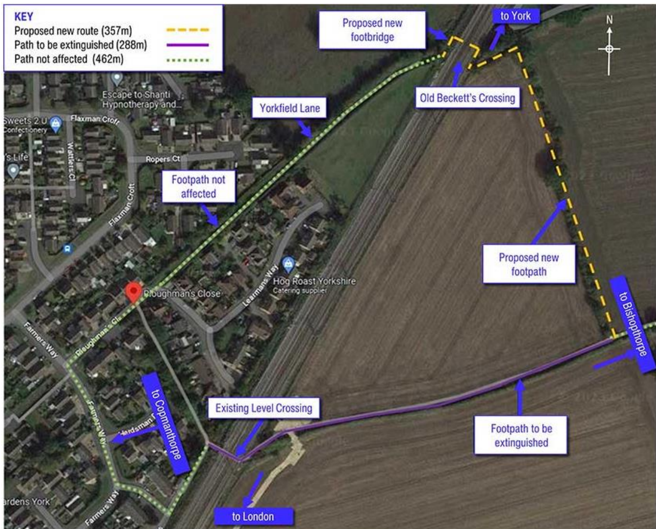
Plan provided by Network Rail